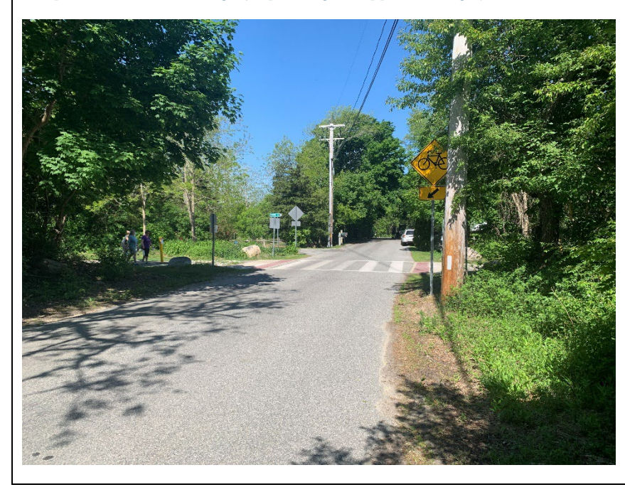
Figure 45: A Wide Crosswalk and Ladder Markings Improve Intersection Visibility

Figure 44: Bike Trail Crossing Signs Could be Partially Obscured by Telephone Poles and Foliage (Depending on Approach Angle)