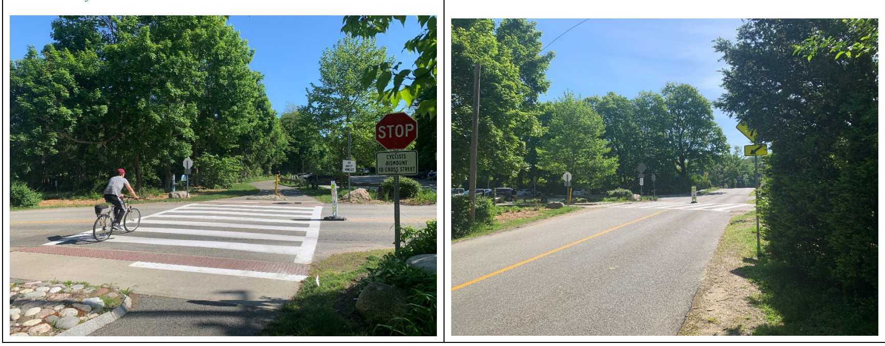
Figure 41: Signage for Eastbound Traffic is Impeded by Foliage

Figure 40: Ladder Crosswalk, State Law "Yield to Pedestrians" Sign Provide Good Visibility