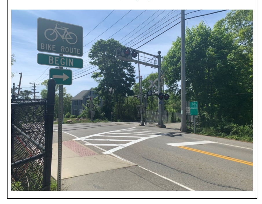
Figure 48: The Presence of the Rail Crossing can Decrease Visibility at Intersection). Zebra Crosswalk Helps Highlight Intersection Users