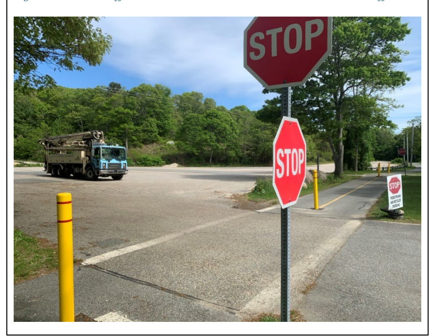
Figure 31: Road Traffic is STOP-Controlled, as is Eastbound Trail Traffic